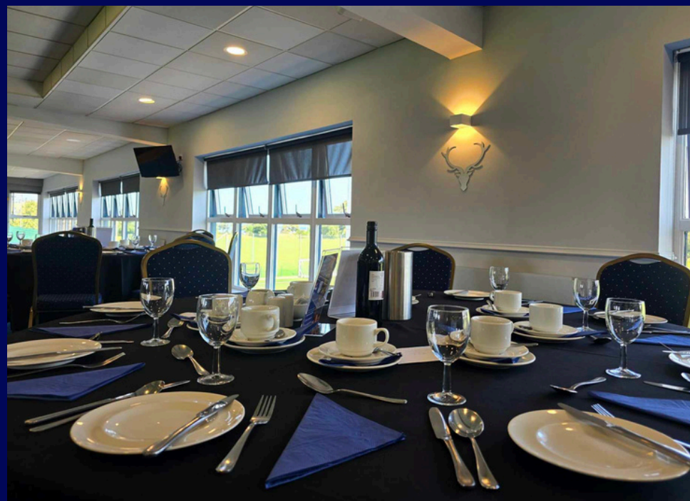
Table booking of eight and four are available for this suite Secure your Victoria Package experience today and elevate your matchday to a new level!